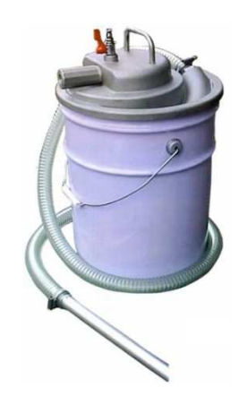
APPQO400 Vacuum Cleaner