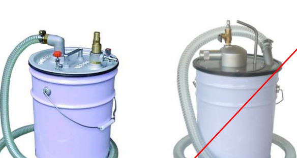
APPQO Vacuum Pump