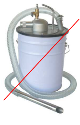
AVC-50 Vacuum Cleaner