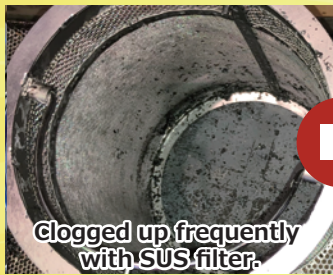
Clogged up frequently with SUS filter.

※ Time is approximate. It depends on clean method and environment.