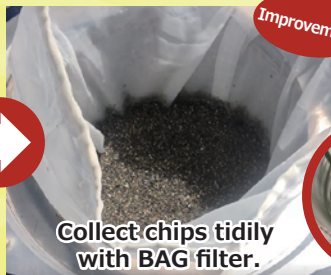
Collect chips tidily with BAG filter.